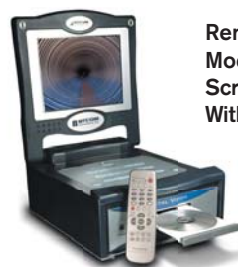
Removable Command Modules with 10.4" LCD Screen Are Compatible With All Length Reels