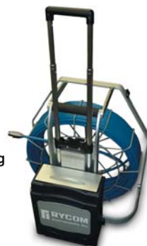
Telescoping Handle and Durable Rubber Wheels for Quiet and Easy Moving