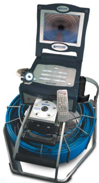
Laptop Style Fold Down Screen Protects Your Camera Investment Between Jobs

Rycom Instruments®, Inc. inspection cameras are designed and manufactured to make pipeline inspection accurate as you need and as simple as you want. For more information on RI-800, 1100, or 1200 Pipeline Inspection Cameras or any other Rycom Instruments® product, please call us toll free at 1-800-851-7347 or visit us at RycomInstruments.com .